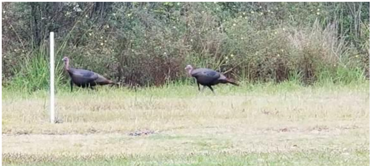
This Picture was Taken on the LRPC Skeet Range December 8, 2019.

THESE NEW SHOOTERS WANTED TO JOIN . . . unfortunately, they had Insufficient Funds .